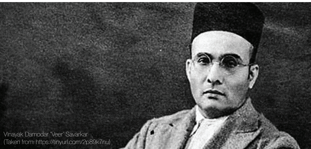
Vinayak Damodar "Veer" Savarkar